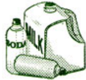
Plastics #1 & #2

NO paper towels, NO food residue, NO blueprints.